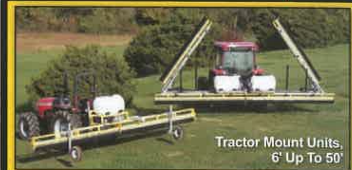
Tractor Mount Units, 6' Up To 50'