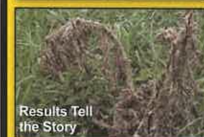
Results Tell the Story

Saving Labor + Chemical = More Profit & Excellent Results