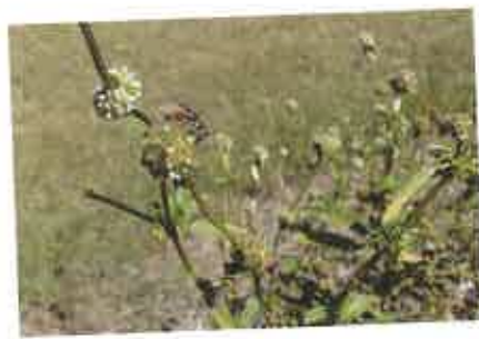
Larry wasp feeding on shrubby false buttonweed