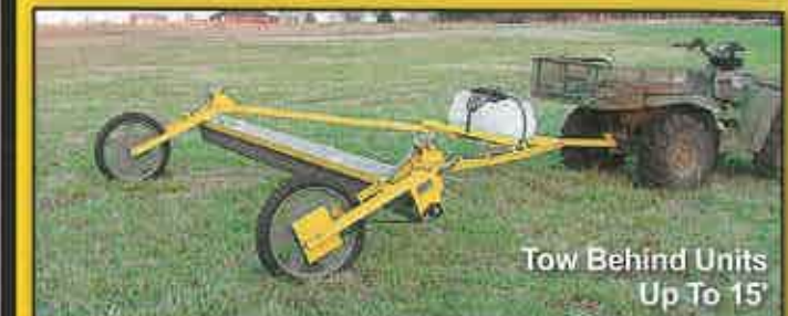
Tow Behind Units Up To 15'