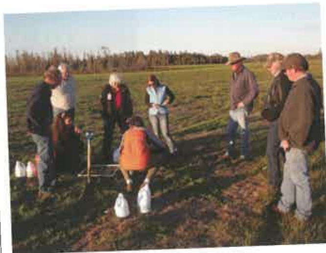
Collecting mole crickets in a Polk County pasture

returned nearly half a billion dollars in savings to Florida's cattle producers in reduced control costs. If one were to measure the benefits to other states and other areas of turf harmed by the invasive mole crickets (golf courses, home lawns, public lands etc.) it would be reasonable to say the benefits could exceed one billion dollars. Not a bad investment of public funds!