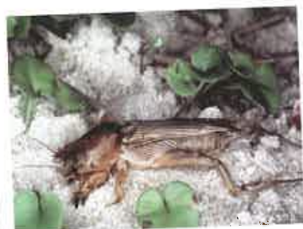
Tawny mole cricket