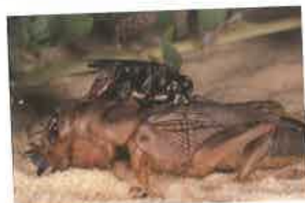
Larra wasp attacking a mole cricket